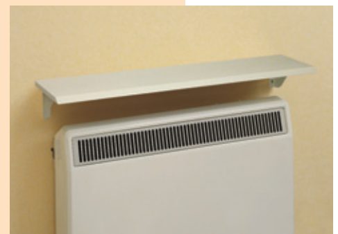
Storage heater with shelf