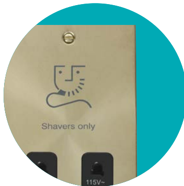
Satin Brass (SB)