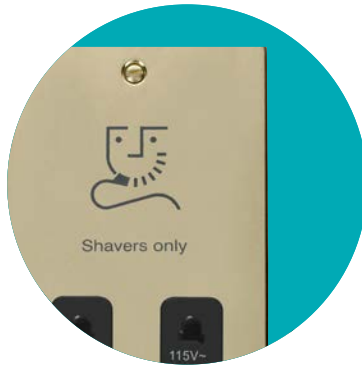
Polished Brass (BR)