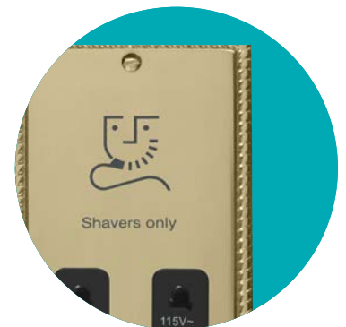
Georgian Cast Brass (GCBR)