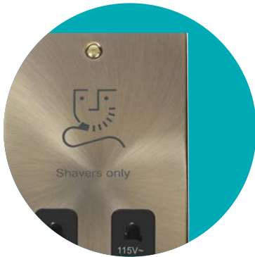
Antique Brass (AB)