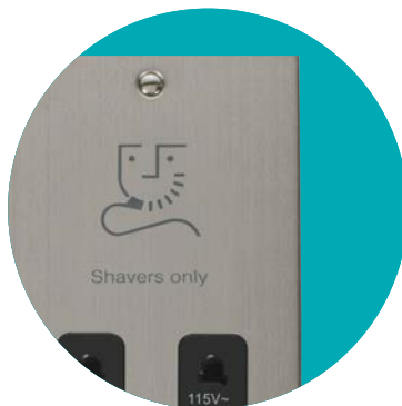
Stainless Steel (SS)