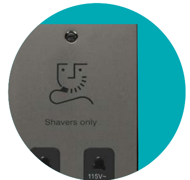
Black Nickel (BN)