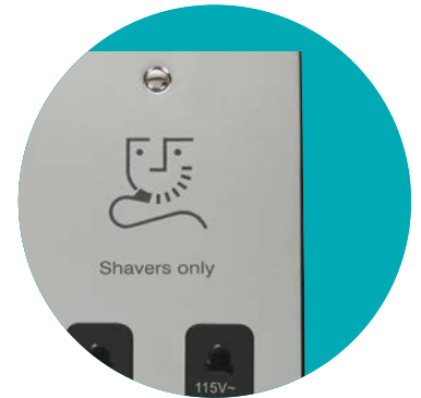
Polished Chrome (CH)