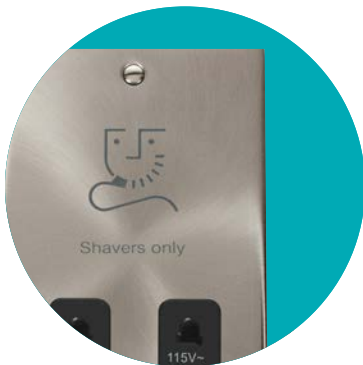
Satin Chrome (SC)