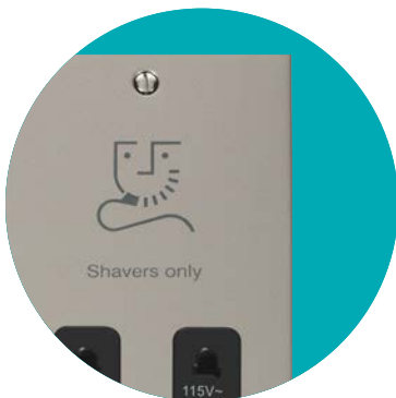
Pearl Nickel (PN)