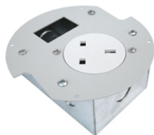
PGS002 13A Power Grommet + 1 Data (Round Socket)