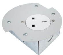
PGS001 13A Power Grommet (Round Socket)