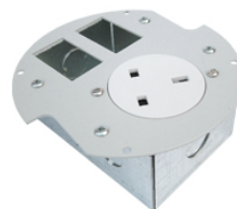
PGS003 13A Power Grommet + 2 Data (Round Socket)