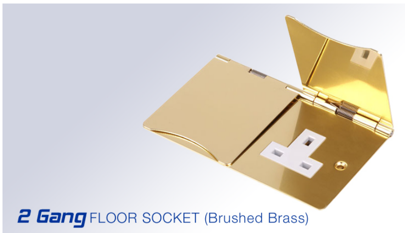
2 Gang FLOOR SOCKET (Brushed Brass)